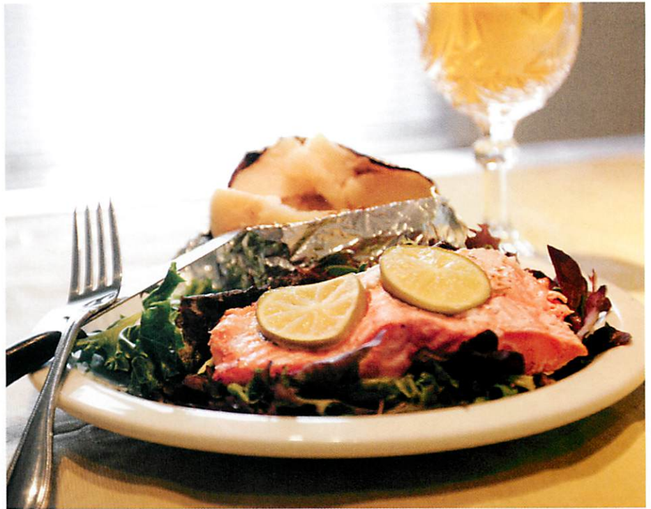
Lime-Garlic Salmon with mixed greens and a baked potato.