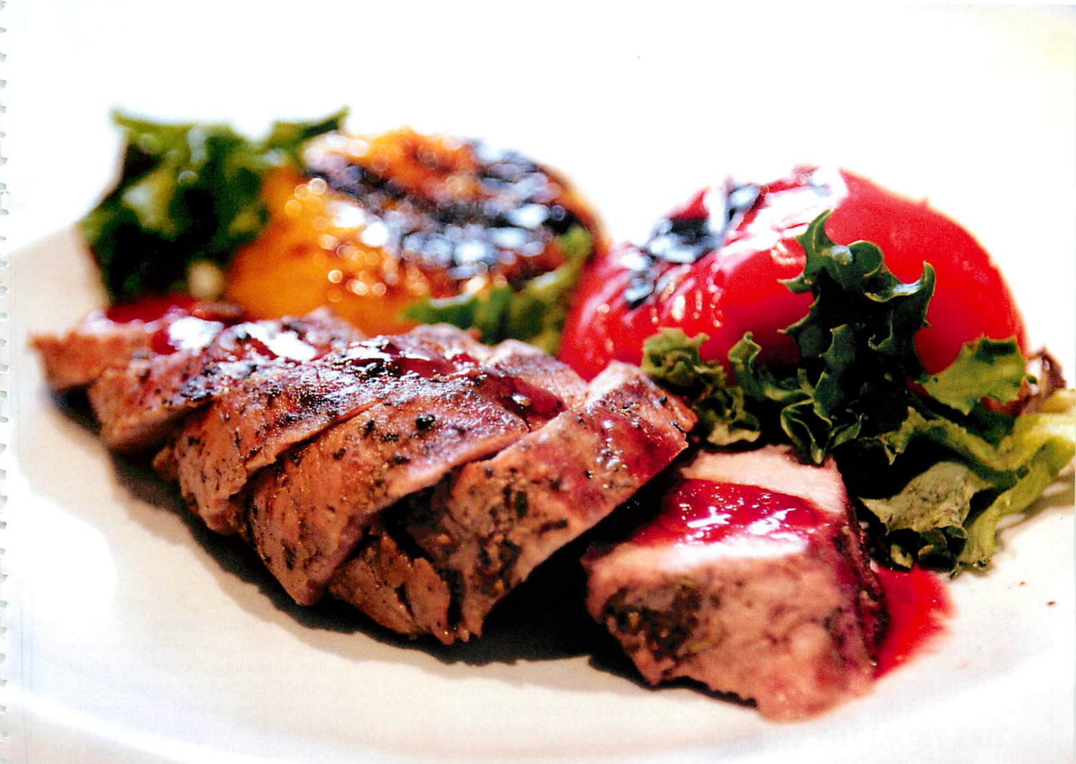
Grilled Pork Tenderloin with Raspberry-Chipotle Glaze, pictured with grilled peppers.